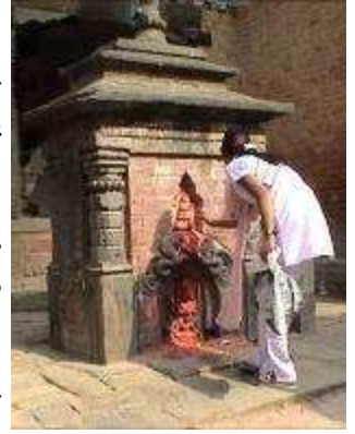
Offering food to a Hindu god at a shrine.

Hinduism is a religion that started more than 3500 years ago. Most people in Nepal are Hindus, and it is a Hindu country. Hindus believe in many different gods but they are all forms of one supreme god. They can choose which gods they want to worship. They go to temples and offer statues of their gods food and money, and pray for help. Many Hindu people also have shrines in their homes or where they work.