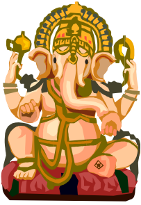
A Hindu god