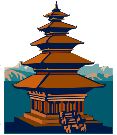
A Hindu temple in Nepal

It is sad that so many people in Nepal think their lives are like a game of snakes and ladders. Play this game with a friend to pray for the people of Nepal! When you land on a prayer item, stop and pray for it. How can you remember to keep praying for Nepal this month?