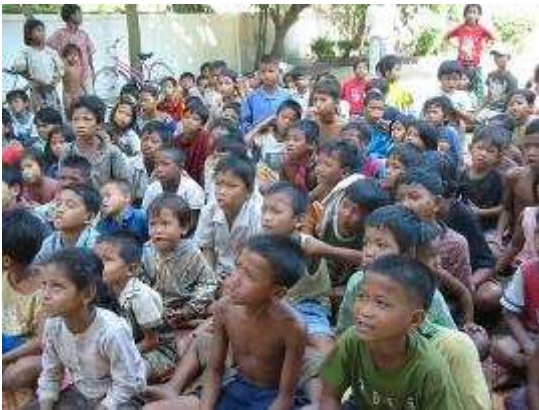
Children listening to a Bible story at the White House

Some of the children have been hurt badly by adults, and there are people at the White House who can help them feel better about themselves. They also teach all the children how to protect themselves from getting hurt by others.