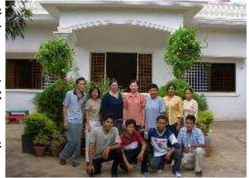
Workers in front of the White House

The White House is a special place where these children can come to wash, get First Aid, play games together and listen to Bible stories.