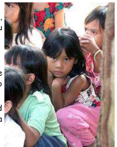
One of the children at the White House

Giving is not just money. How else can you be a World Champion to those around you by giving? Look on our website for ideas.