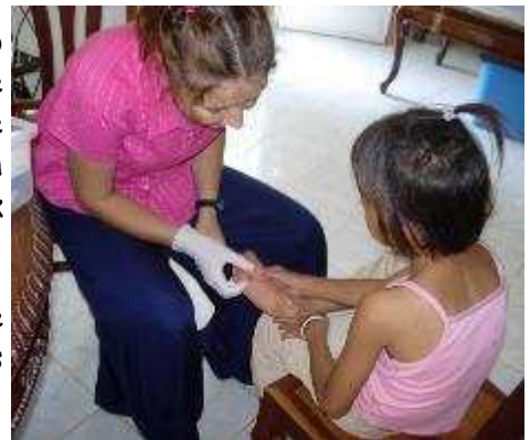
This girl has come to the White House to get treatment for her cut foot.

White House workers also help the families of these children and even go on the radio every month to teach listeners about how to work with children.