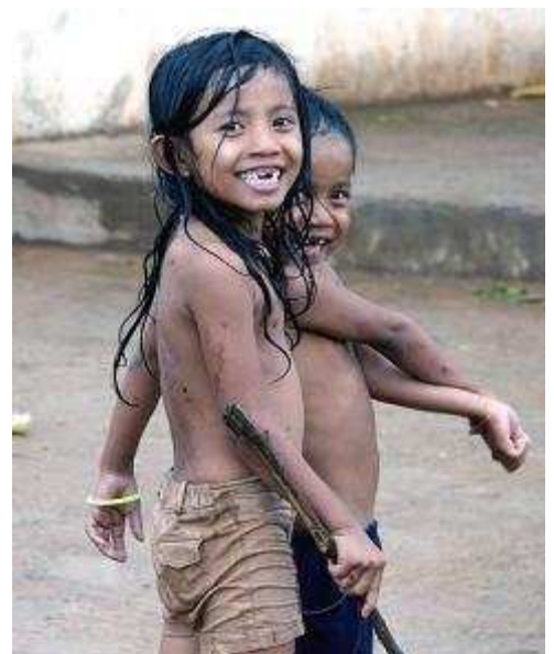
Cambodian children playing in the rain